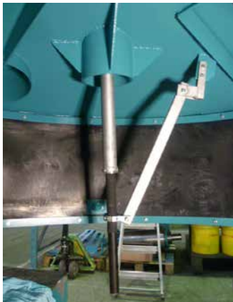
Self-cleaning electrode in the mixer