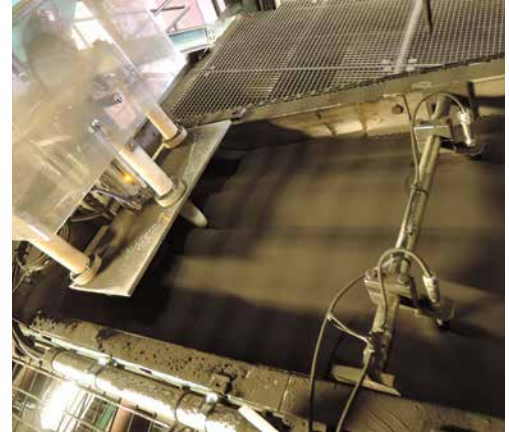
The tripolar measuring electrode TFS141 measures the moisture content of the reclaimed sand on the conveyor belt.