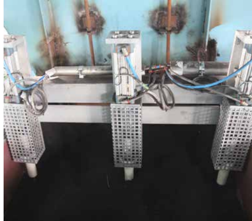
Three monopolar moisture measuring electrodes MFS111 for broad batching belts