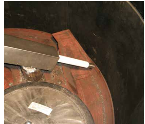
Rotating electrode in the mixer